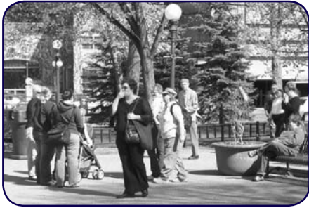
Stealthy One Voicers gather in Rice Park