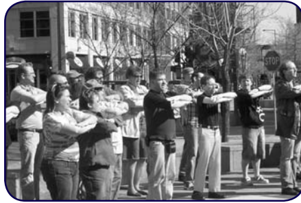
Playing to the crowds in downtown St. Paul