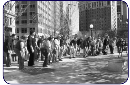
One Voicers dancing in the street!