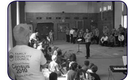
Our preview concert was a hit with the Rainbow Families kids