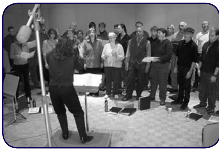
One Voice recording at MPR's studio