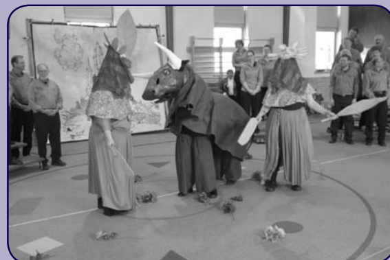
Ferdinand goes back to his pasture to live happily ever after