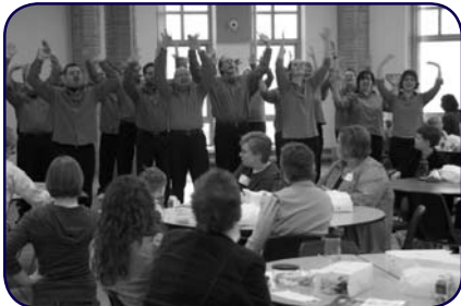
Our flash performance at Rainbow Families

With our upcoming concert focusing on kids, it seemed a natural fit to perform a preview concert at the Rainbow Families conference in April. It was a great way to connect with GLBT families and celebrate diversity through our music. In addition to two Flash concerts during lunch, we performed a stand-alone concert featuring highlights from Different is GREAT! , including a sing-along with Supercalifragilisticexpialidocious and a fully-staged version of “Ferdinand the Bull,” complete with props, costumes and sets!