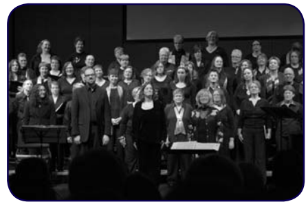
Well-deserved applause for Unsilenced