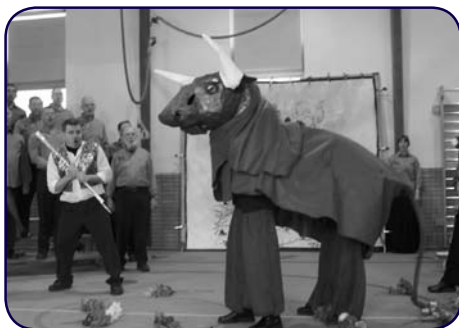
Ferdinand’s debut at the bullring