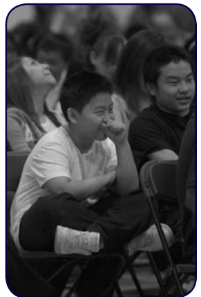
Community of Peace Academy students loves the show

Concert highlights included songs that celebrate differences among people, built around the phrase "normal is fine but different is great!" One particularly touching song, One Dad, Two Dads, Brown Dads, Blue Dads... , featured a charming look at a non-traditional family. We also included our own special takes on Supercalifragilisticexpialidocious and Zip-a-dee-doo-dah . The performance also included fully-staged story of "Ferdinand the Bull" (see page 5).