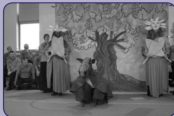
Young Ferdinand among the flowers

“These songs and stories bring such wonderful memories bubbling up,” enthuses soprano Darcy Juhl. “And, as an adult I can hear their messages with a fresh ear. These are not just simple songs but powerful messages that shape how we treat one another and honor the things that make us different even as adults! Seeing the kids respond, I think