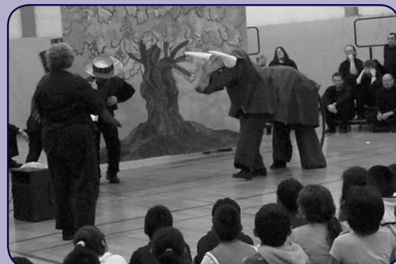
Instead of fighting, Ferdinand stops to smell the flowers