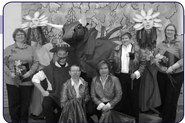
Cast of Ferdinand

Generations have loved the tale “Ferdinand the Bull” about a gentle-souled bull who would rather smell the flowers than fight in the bullring. Now the story comes to life—with a little help from One Voice. As part of our Different is GREAT! concert, One Voice presents a fully-staged version of the story with sets, costumes and actors portraying singing flowers, furious matadors and Ferdinand himself. Musically, we tell the story with selections from the beloved opera “Carmen,” including the fiery Toreador’s Song , as well as Flight of the Bumblebee and more.