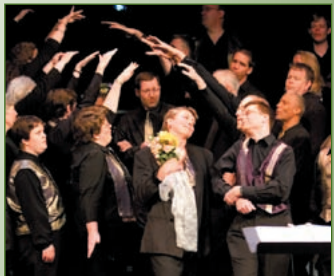
There's nothing like celebrating your love with the world