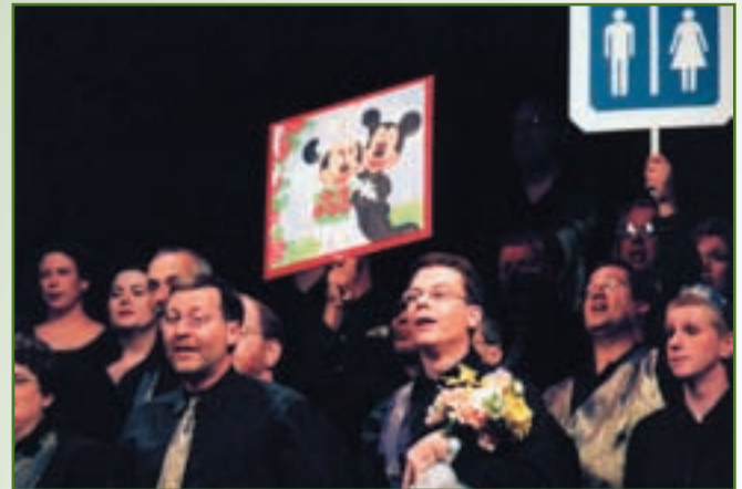
Committed relationships are for everyone, not just cartoon mice!