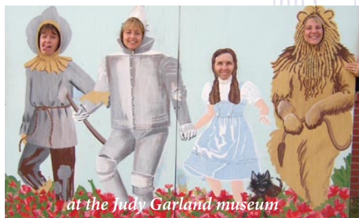
at the Judy Garland museum