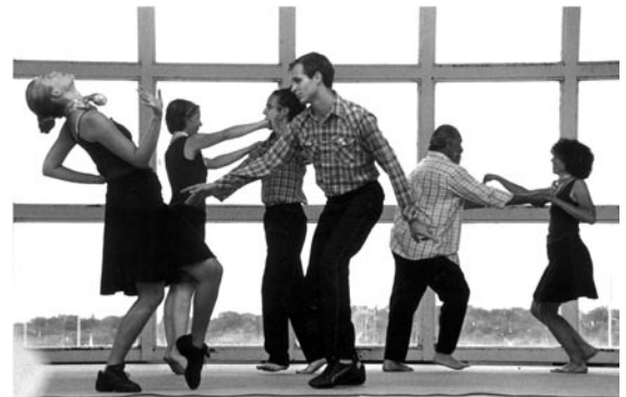
Kairos Dance Theater