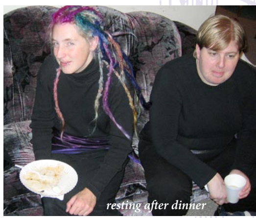
resting after dinner

Sunday brought us to Peace United Church of Christ in Duluth. As we gathered to warm up, we were delighted to see our groupie friends from Bemidji were still with us. We contributed the music for the kick-off of a national ad campaign called 'God is still speaking...' highlighting the inclusive spirit of UCC churches across the nation.