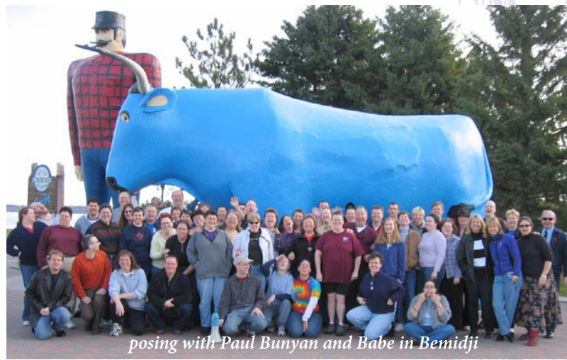
posing with Paul Bunyan and Babe in Bemidji

On Saturday we departed for Grand Rapids and a concert at Itasca Community College, hosted by long-time GLBT community activists and a local PFLAG group. Many OVMC members took the opportunity to visit the Judy Garland museum in town. This performance featured more of the Building Bridges repertoire, poetry readings and personal stories from chorus members, a couple selections from our small ensemble, OVation; and involved audience participation on Bridge Over Troubled Water . At a reception following the concert, we discovered we had acquired a small fan club of five young people from Bemidji, affectionately referred to as OVMC groupies.