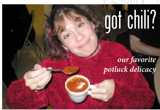
our favorite potluck delicacy

We went to the woods of greater Minnesota and encountered rivers that could have divided us, but as we began building bridges we found eager young people, university students, AIDS activists, and church congregations ready and willing to join us in the construction. Many OVMC singers now have their own symbolic nail on which hangs the memory of these communities – the faces of people we met and the bridges we built with them there. ■