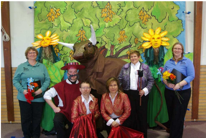
Cast of "Ferdinand the Bull"

Music selections encourage young listeners to welcome diversity in their lives and be true to themselves. Along with Billy Joel's classic, Just the Way You Are , other selections include I'm Different and Don't Dress Your Cat in an Apron . Music from global cultures includes a stunning rendition of De Colores and the delightfully percussive SikSik Si Batu Manikkam from North Sumatra.