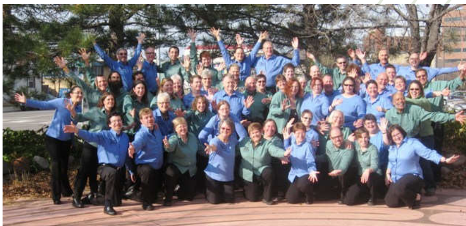
One Voice Mixed Chorus